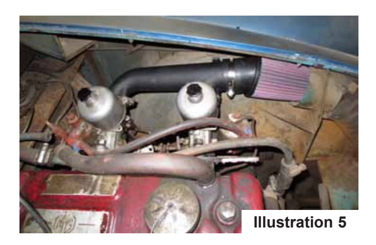
Enjoy your new cold air intake! See mossmotor.com for all your classic British car needs.

Now that the CAI is installed, make final adjustments to the position of the filter. Finally, tighten the band clamp with an 8mm socket or nut driver.